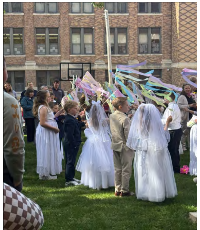
St. Francis School students participated in May Crowning on Wednesday, May 6, which was also Special Persons Day.