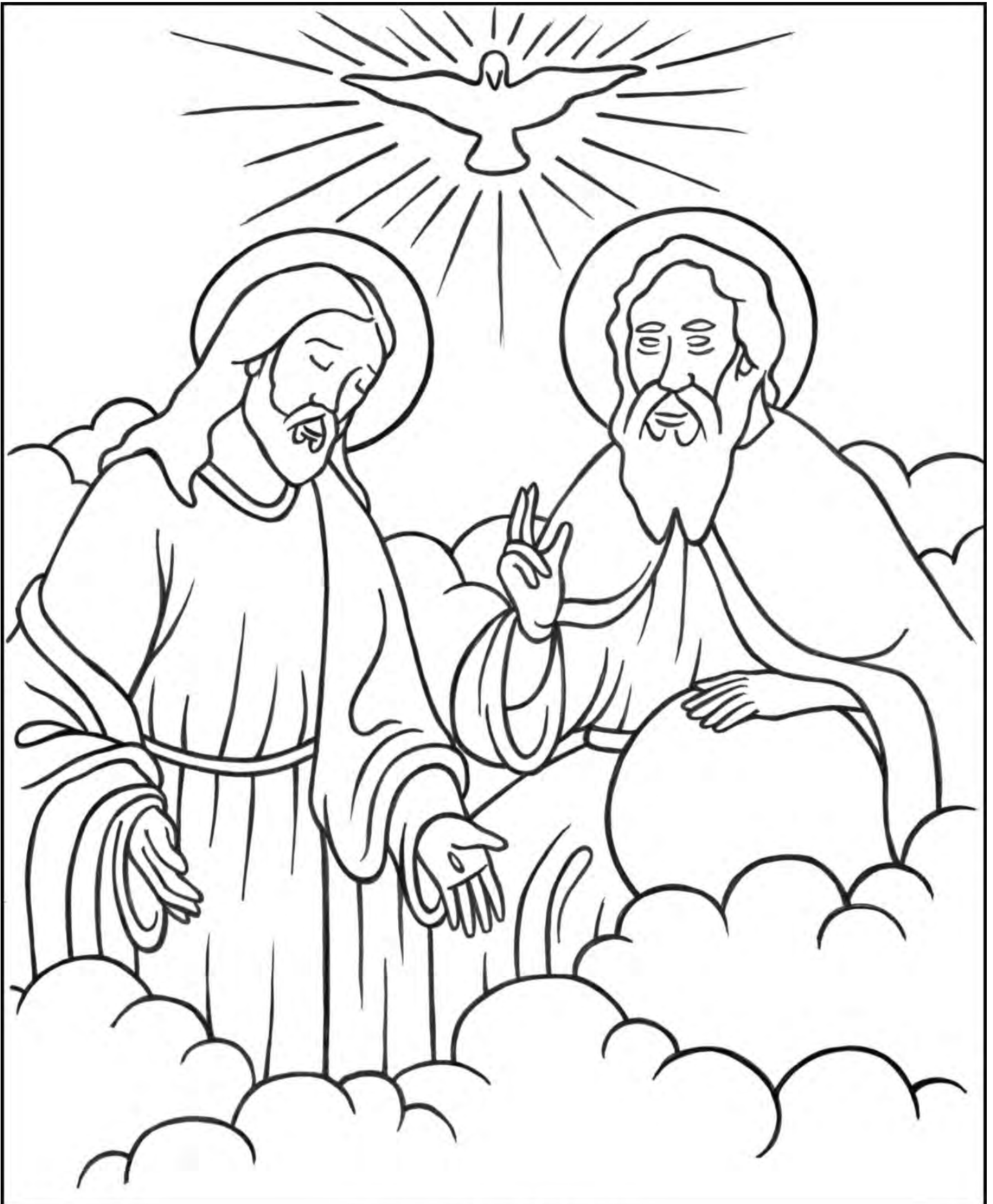
The Most Holy Trinity - Father, Son and Holy Spirit